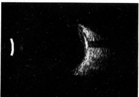
Figure 2 Echographic B-scan of the same eye at the same time as Figure 1. A highly reflective area can be seen within the residual tumour. Posterior to this area a marked shadowing is present.