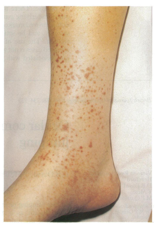
Figure 2 Vasculitic rash before treatment with steroids.

There have been 19 reported cases, including one fatal case, of periorbital necrotising fasciitis and these cases have usually been seen in associa-