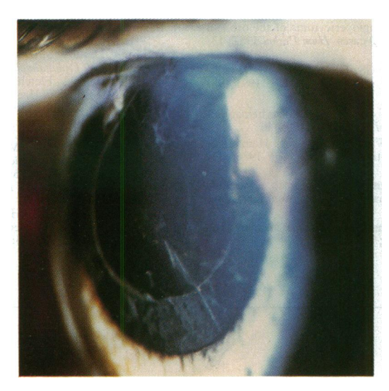
Figure 1 Flat anterior chamber with posterior capsule herniating through capsulorrhexis.