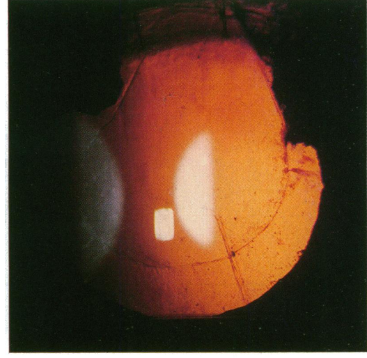
Figure 3 Retroillumination before Nd:YAG laser posterior capsulotomy.

tered aqueous. Her corrected acuity remained good at 6/9.