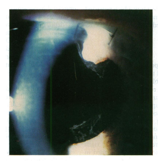
Figure 2 Deep anterior chamber immediately following Nd: YAG posterior capsulotomy.

Von Graefe<sup>1</sup> introduced the term 'malignant glaucoma' in 1869 to describe raised intraocular pressure associated with a flat anterior chamber following uneventful surgery for angle closure