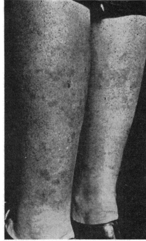
FIG. 2.—Exanthemata on both legs.