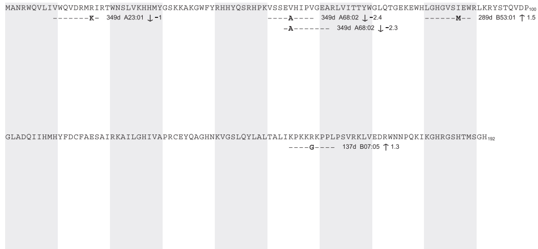
SUPPLEMENTARY FIG. S2. (continued).