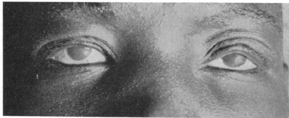
FIG. 3.—Post-operative result in the same patient.