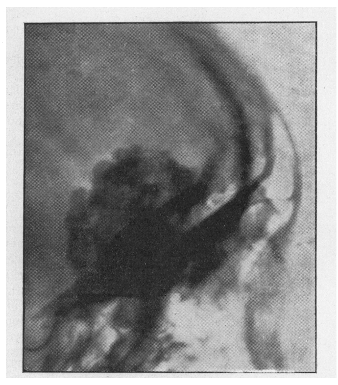
FIG. 1. Orbito-cranial osteoma.

intervention might offer serious consequences. Impressed by these explanations, she asked to be allowed to consult her family. During the following days, the symptoms grew considerably worse. Indeed, headaches became more intense, temperature oscillated between 97^{\circ} and 100^{\circ} F., and she had vomiting. From time to time she suffered