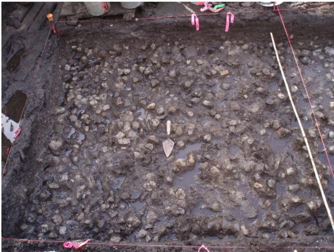
fig. S2. Plan view of SRP feature from garden area. Pink string indicates boundary of 2 metre by 2 metre excavation unit. Trowel tip oriented north.