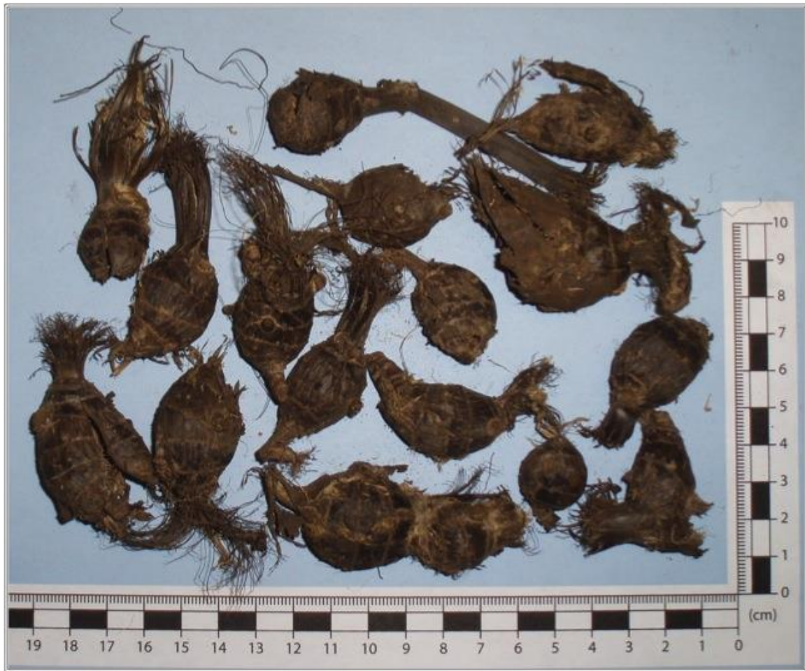
fig. S3. Sample of conserved wapato ( S. latifolia ) tubers excavated from DhRp-52 wet-site deposits.