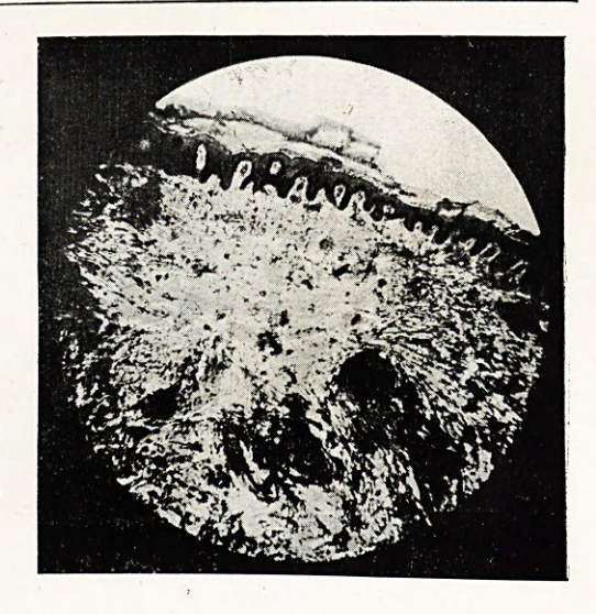
Fig. 3.—Photomicrograph—mag. × 40. Section stained with sudan III. Fat granules and globules scattered all over the corium.