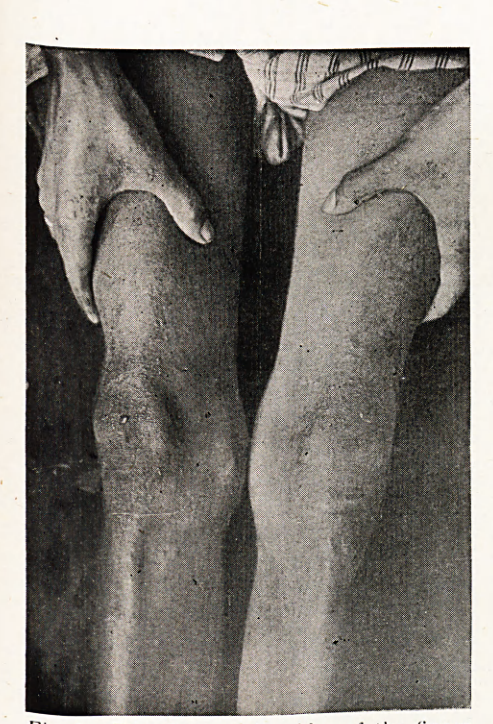
Fig. 2.—Eruption on the sides of the finger and web between the fingers and in front of the knee joint.