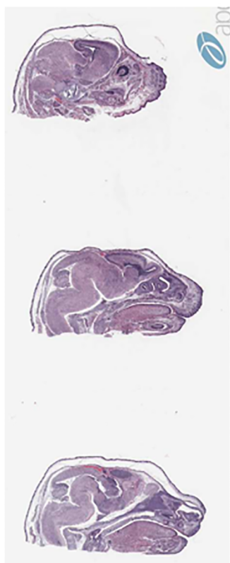
Csnk1 \delta Null #B