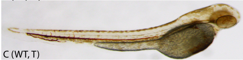
C (WT, T)