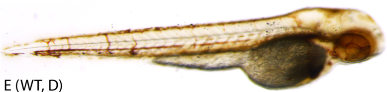
E (WT, D)