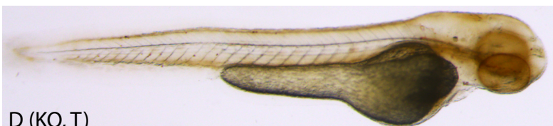
D (KO, T)