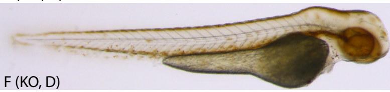
F (KO, D)