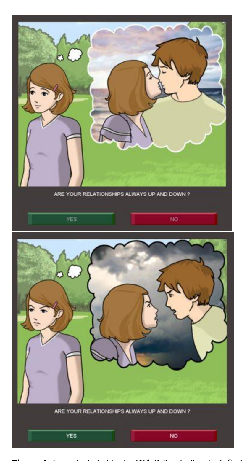
Figure 1. Items included in the DIA-R Borderline Trait Scale (girl version).