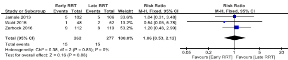
Fig S1 c: Dialysis dependence on day 90