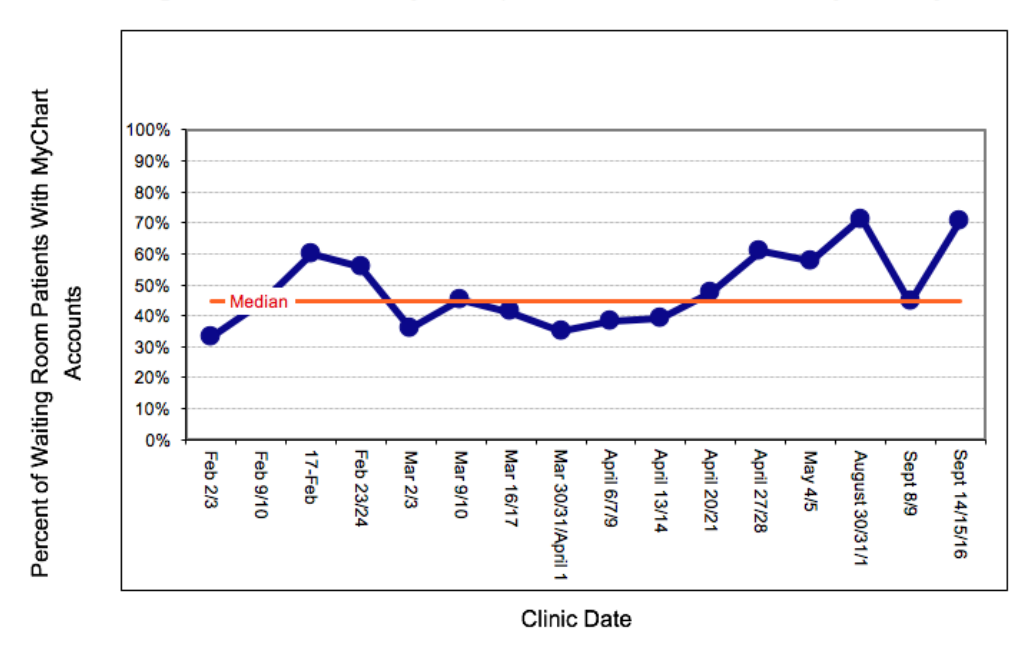
Figure 5 (Supplemental): MyChart enrolment

Interventions to increase MyChart enrollment began mid-November 2014, and patients were surveyed in the waiting room between February and September 2015 about whether they had a MyChart account.