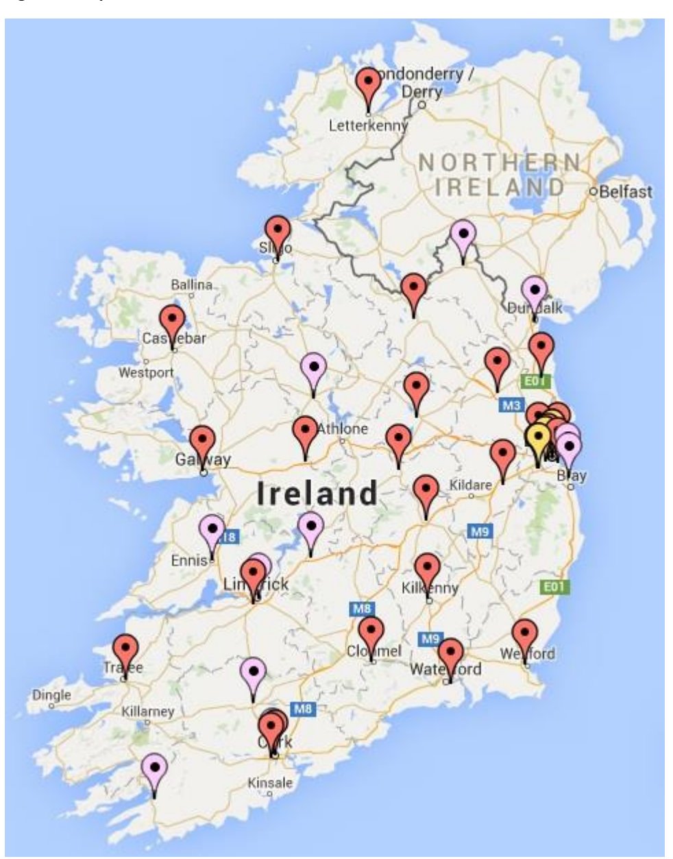
Figure 2. Map of ED and MIU locations in Ireland.

The map provided in Figure 2 shows the locations of public acute hospitals in Ireland. In this map, red pins represent hospitals with emergency departments operating 24/7, pink pins represent hospitals with minor injury units or emergency departments operating over limited daily hours. Yellow pins represent hospitals with emergency departments dedicated to children.