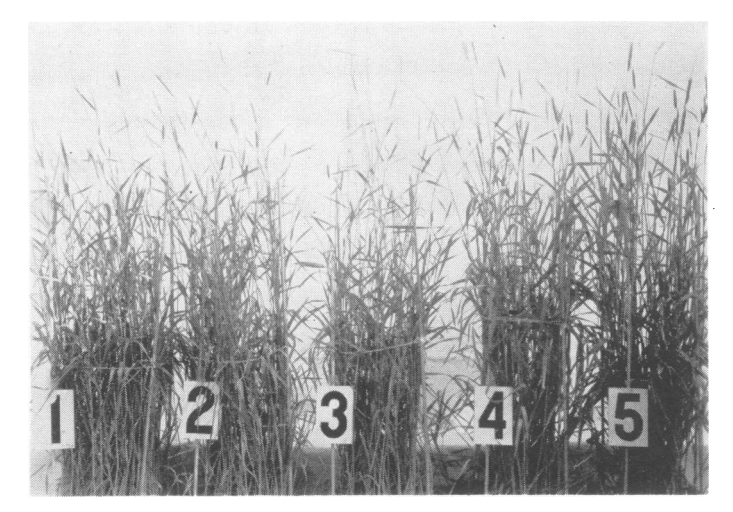
FIG. 3. Ottawa Select spring rye grown on soils 1 to 5. Rye did not develop deficiency symptoms on any of the treatments.

little response to copper, but as the plant became reproductive the burs failed to develop where copper was limited. Cocklebur thus differed from wheat, barley, okra, and milo which were all markedly reduced in growth. A very high endogenous activity was observed in determining ascorbic acid oxidase activity in copper-deficient milo plants. A poor correlation (table I) between visual deficiency symptoms and ascorbic acid oxidase activity was obtained for milo grown on soil treatments 1, 2, and 3. Treatments 4 and 5