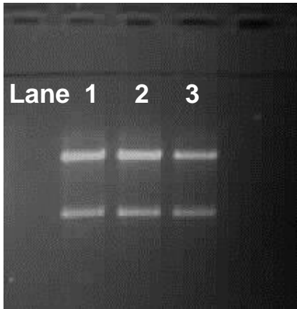
Fig. 2C Lanes 1-3