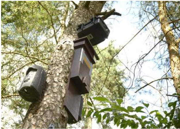
Figure S2. D500x detectors were placed in Explorer Cases permanently mounted in the tree closest to the light post in the forest edge.