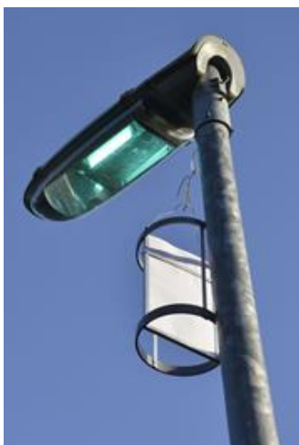
Figure S3: position of custom-made white sticky traps below the light post.