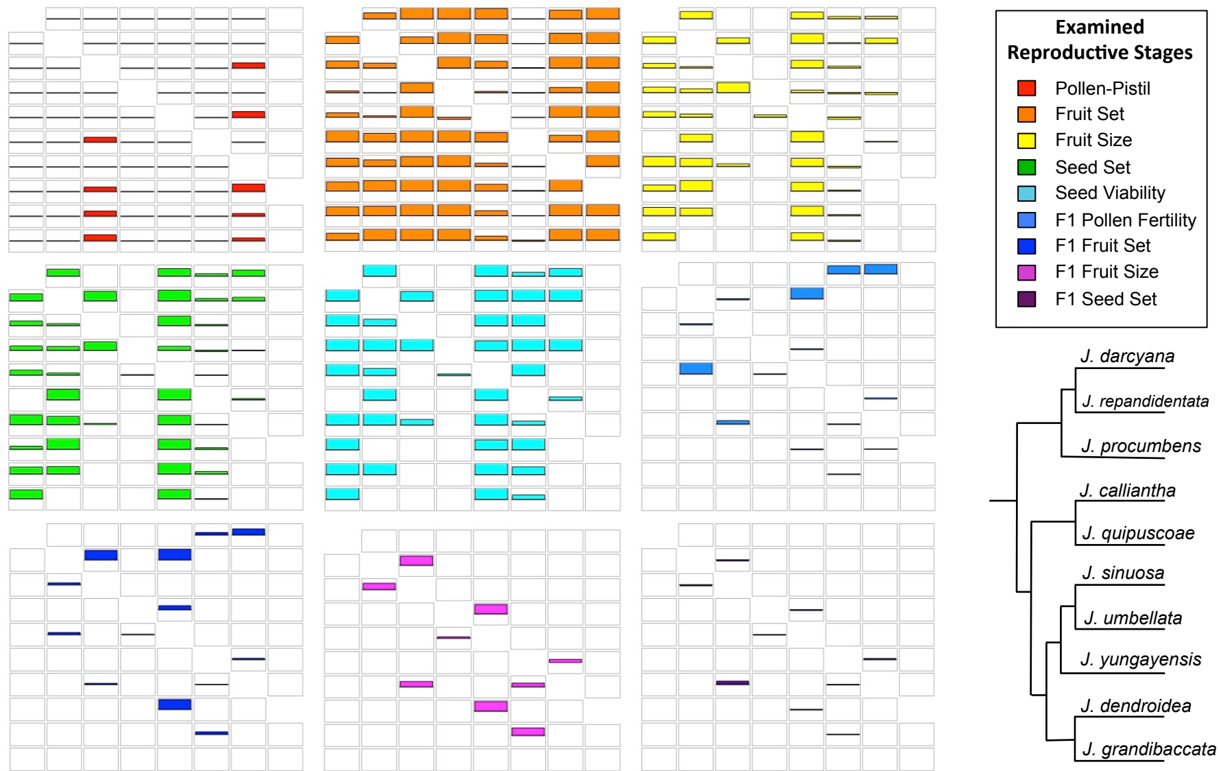
Supplementary Figure 2. Reproductive isolation for examined species combinations, across 9 postmating stages. For each stage, columns represent species acting as the mother while rows represent species acting as the father, arranged in phylogenetic order as shown in the inset cladogram. Blank cells indicate species pairs for which RI could not be calculated: intra-specific controls (diagonals) as well as later-acting stages when RI is complete at an earlier-acting stage. Cladogram based on the 60 transcripts used to estimate genetic distance (see Methods).