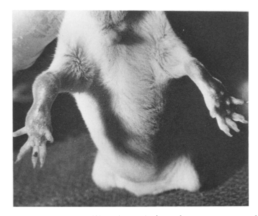
FIG. 4. N. brasiliensis 27-infected mouse 1 month after footpad inoculation. No inflammatory or necrotic response was detected at this stage of the infection.

The fact that the N. asteroides-infected mice