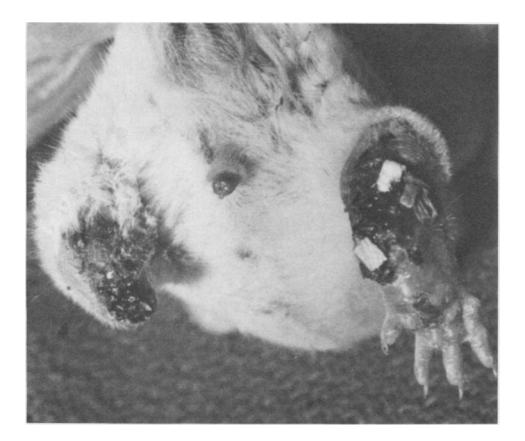
FIG. 3. N. asteroides-infected mouse 1 month after footpad inoculation. Note early necrosis of toes and foot.