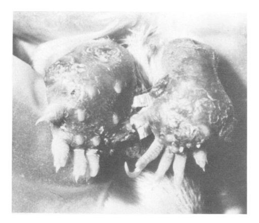
FIG. 6. N. brasiliensis 27-infected mouse six months after footpad inoculation with 1.0 \times 10^5 colony-forming units per ml in incomplete Freund adjuvant.

showed local healing reactions 5 months after inoculation might be due to the dose of organisms used, since N. asteroides is considered to be one of several actinomycetoma causative agents (8).