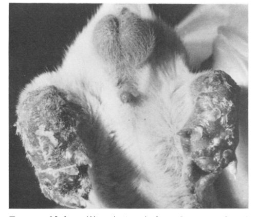
FIG. 2. N. brasiliensis 267-infected mouse showing typical mycetoma lesions 1 month after footpad inoculation with 0.1 ml of 1.2 \times 10^7 colony-forming units per ml in Freund incomplete adjuvant.