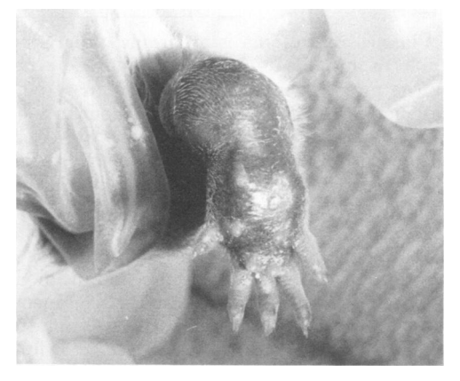
FIG. 1. N. brasiliensis 27-infected mouse 3 months after footpad inoculation with 0.1 ml of 1.0 \times 10^5 colony-forming units per ml in Freund incomplete adjuvant.

Five months after inoculation, those animals infected with N. asteroides and N. caviae showed involution of the mycetoma lesions at the local site of inoculation. The disease had disseminated to the stump and peritoneal cavity, where masses of the organisms could be detected by palpation. The animals inoculated with N. brasiliensis, especially those receiving the low dose of the organism, exhibited a different pattern for the evolution of the disease. After 5 months, the lesions were largely confined to the feet and the inflammatory response began to