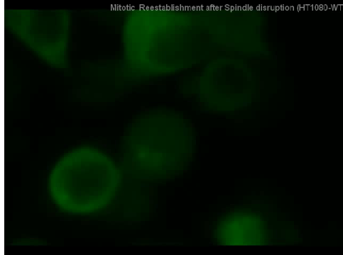
Movie 8A (control)