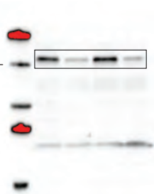
Figure 4A - DDB2