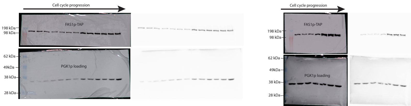
Figure 4C. Source data used in quantification of Fas2p levels through a synchronous cell cycle.

Fas1p experiments (2 data sets) were digitally recorded. Left (darker) image is an overlay of the blot with chemiluminescent signal shown for informational purposes only. The image to the right (lighter) is the raw image used for quantification.