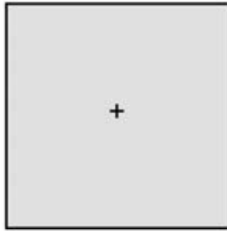
Retention interval 900 ms