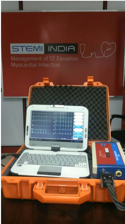
eFigure 1. STEMI Information Technology Kit