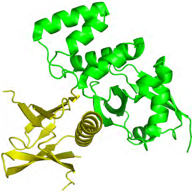
sorting nexin-17 PDB 4tkn