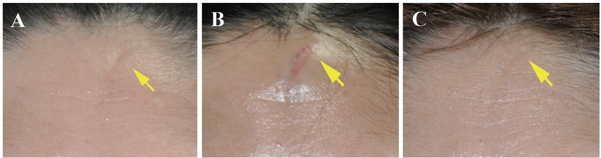
eFigure 2. A linear atrophic scar on the forehead preoperatively (A), immediately postoperatively (B), and 1 year postoperatively (C)