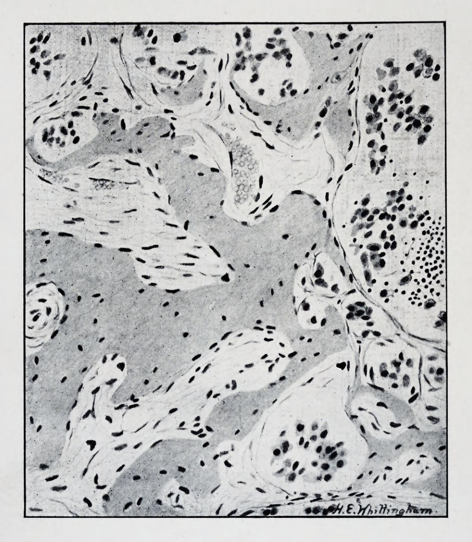
Fig. 1. Cancer in inguinal glands; fibrous stroma showing cartilage formation.