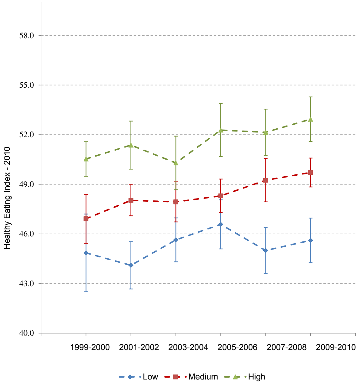
eFigure 2. Healthy Eating Index-2010 Score Among Different Socioeconomic Status by the NHANES Survey Cycle

Data are presented as covariate-adjusted means and 95% confidence intervals. Participants with more than 12 completed years of education attainment and a PIR \geq 3.5 were categorized into high SES; participants with less than 12-year education attainment and a PIR < 1.30 were categorized into low SES; and others were classified as medium SES. Values were estimated from multivariate linear regression by adjusting for gender (male, female), age group (20-39, 40-64, \geq 65 years), race/ethnicity (non-Hispanic white, non-Hispanic black, Mexican American, other), and household size.