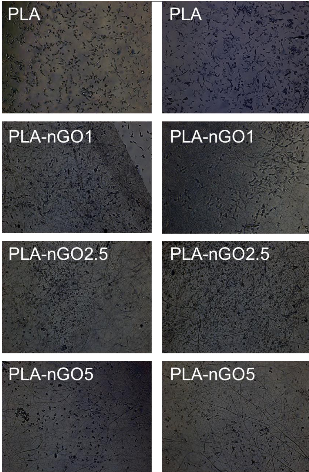
Figure S2. Optimal images MG63 cells on the PLA, PLA-nGO1, PLA-nGO2.5 and PLA-nGO5 after 4 days of culture.