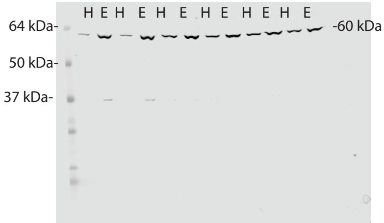
Fig 2b Full Length Western Blot (HDAC3)