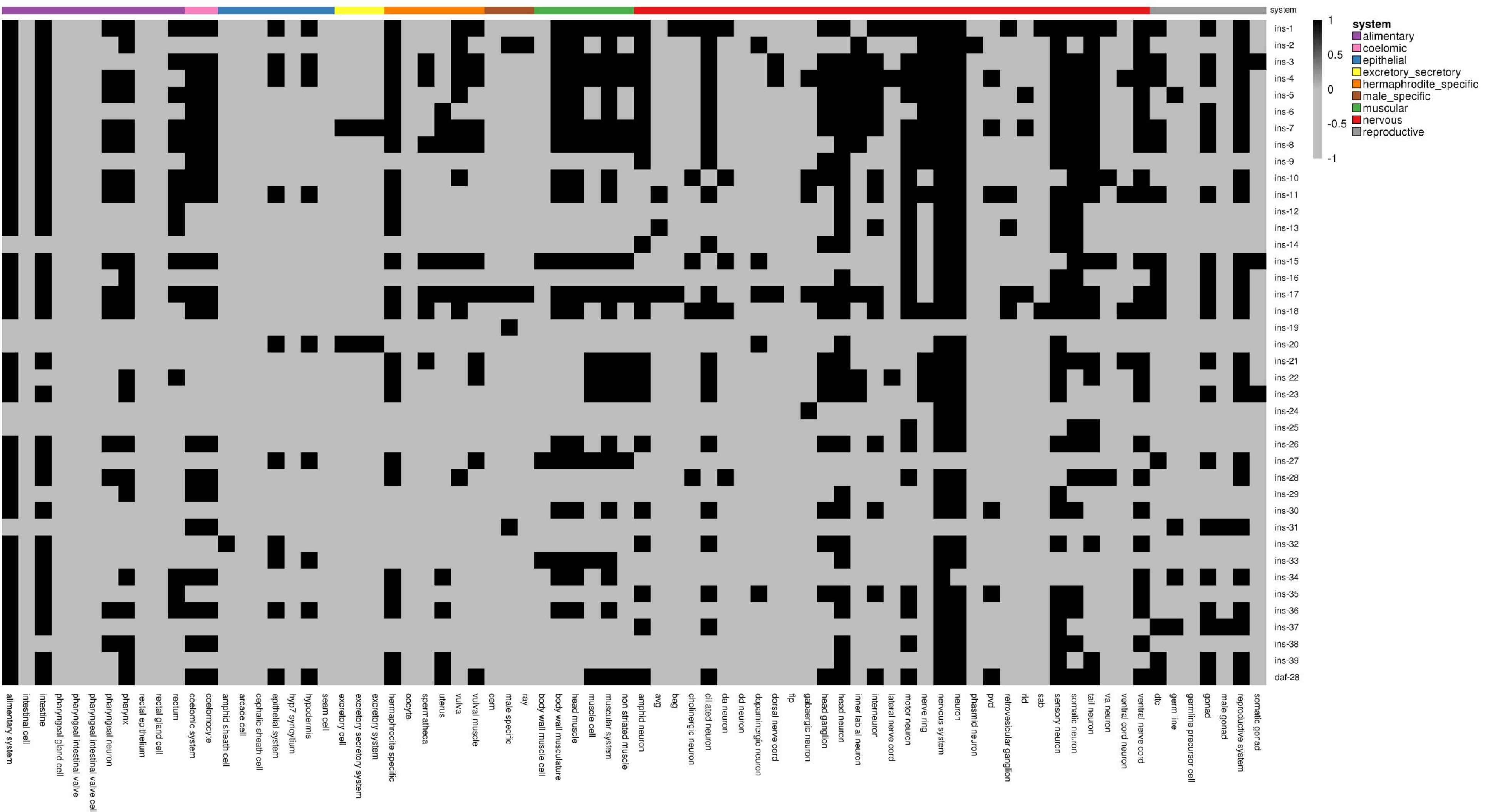
Supplemental Figure 7