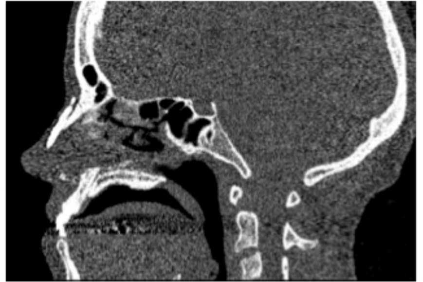
CT Scan at 8 years