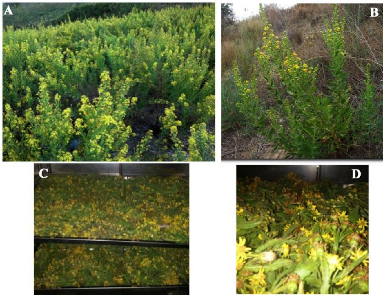
Supplementary Fig. S1. D. viscosa plants (insets A, B) in the site of sampling, a rural area near Campobasso, Molise region, Italy (650 m a.s.l.); particular showing the aerial part collected to be dried and ground for solvent extraction (insets C, D).