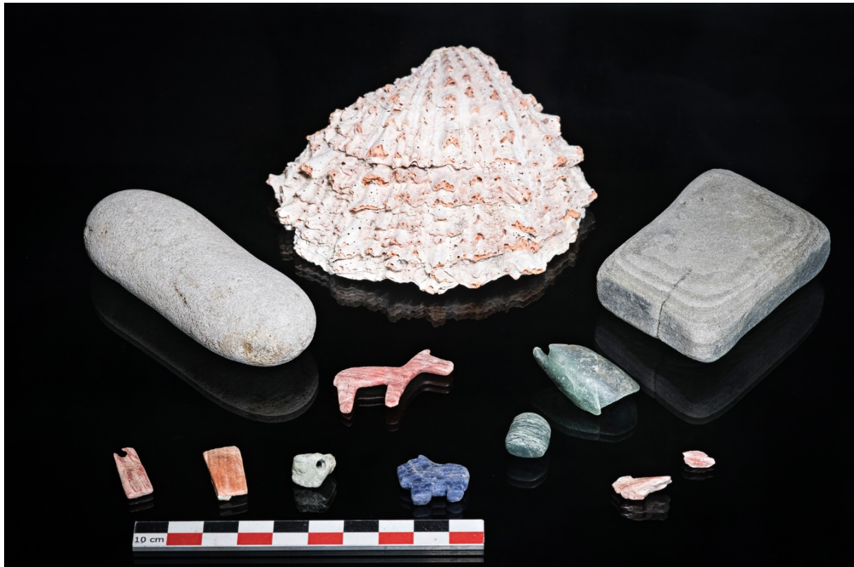
Fig. S2. Thorny oyster ( Spondylus spp.) shell and lapidary items found in Khoa in association with Tiwanaku contexts.