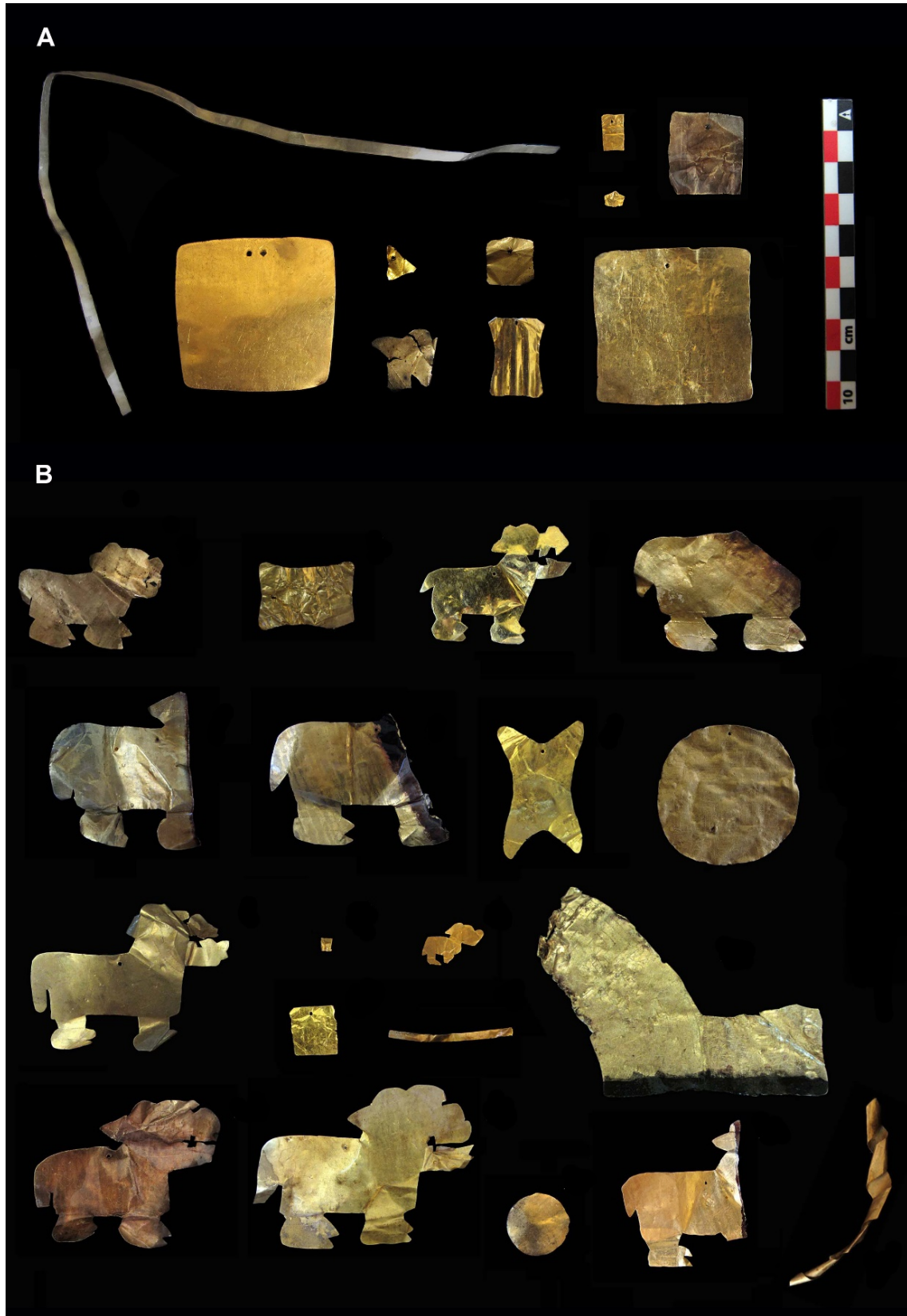
Fig. S1. Gold artifacts recovered from Tiwanaku contexts in A) Unit #1 and B) Unit #3 at Khoa.