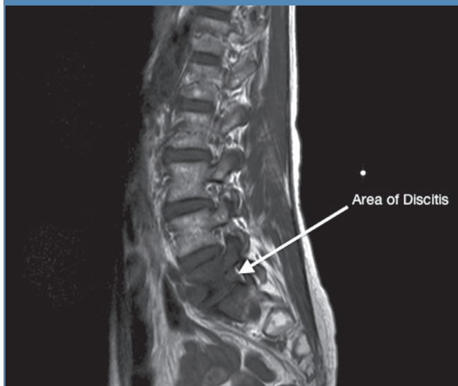
Figure 1. Lumbosacral spine X-ray showing discitis at L5/S1 level