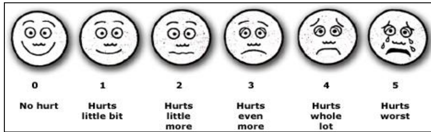
Left: A reproduction of the "Wong-Baker FACES Pain Rating Scale"