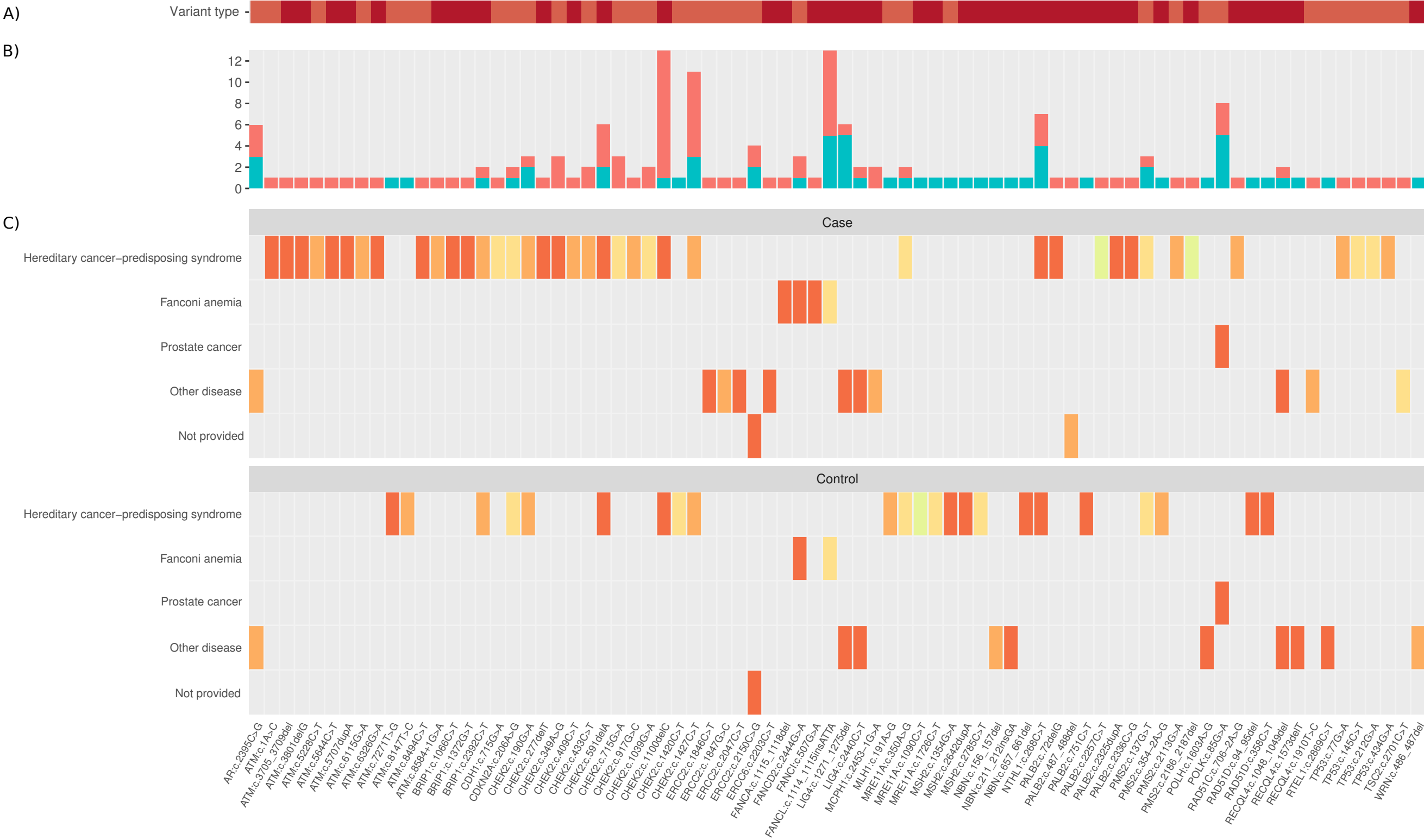
A) Variant type