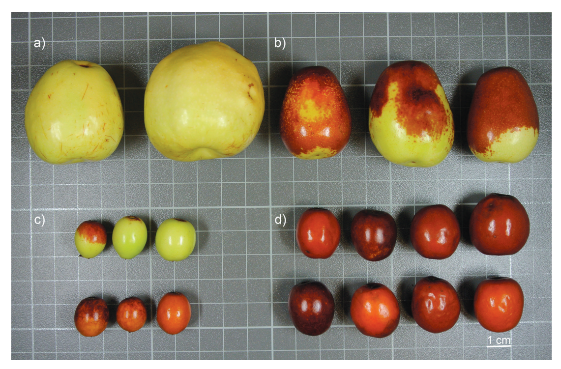
Fig. S1. Fruit characteristics of: a) variety 'Li', b) variety 'Lang', c) sample Zj17 (tree formed from the rootstock after scion had been detached), and d) variety 'Navadna žižola'