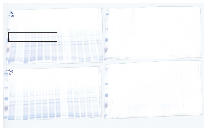
Figure 1 panel C