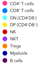
Average percentage of cells