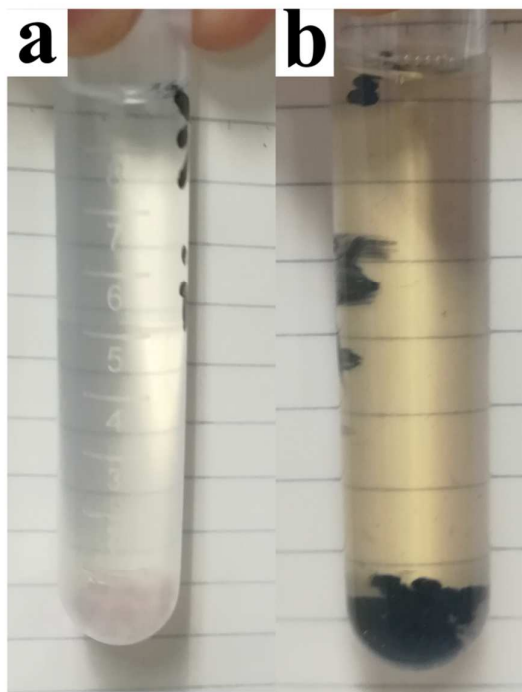
Figure S1. Chromogenic reaction of TA-PVA/SA with \text{FeCl}_3 ; (a) TA-PVA/SA hydrogel beads soaked in pure water, (b) colour reaction of dropping \text{FeCl}_3 .