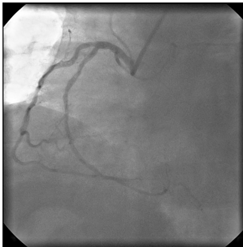
FIG. 1 Two right coronary arteries in left anterior oblique projection during coronary angiography.

A 60-year-old man was diagnosed as having an anterior myocardial infarction and was treated with tissue plasminogen activator (tPA). When coronary angiography was performed later to evaluate his coronary anatomy, an interesting finding was found to be present in the right circulation. There were two different right coronary arteries originating from the right sinus of Valsalva with the same ostia (Fig. 1 and 2). In addition,