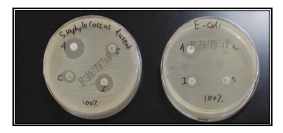
Figure 2: Antibacterial activity of Citrus aurantifolia essential oil (10 µl) against S. aureus and E. coli .