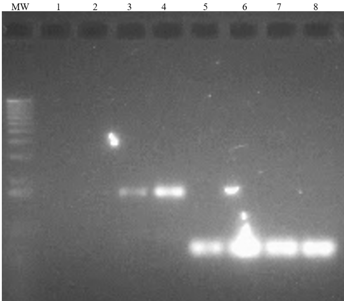
Figure S2: Electrophoretic patterns of PCR products of the 18S rRNA gene and rDNA internal transcribed spacer ITS1-4 genomic region. Lane 1, 2 negative control of each primer pair (no DNA added); lanes 3, 4 correspond to gene 18S rRNA 1500 pb amplified using primers 18S F and 18S R; lanes 5, 6, 7 and 8, a 600 pb band corresponding to ITS1-4 amplicon using universal primers ITS 1 and ITS 4. MW molecular weight 1 Kb Plus (Invitrogen). The annealing temperature in both cases was 60 °C.