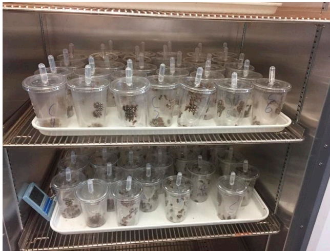
Figure S1. Worker honey bees housed in bee cups for assays.

For the mark-recapture assays, bees were painted on the thorax with distinctive colors, returned after treatment to a common container for two hours (Figure S2) and then released to host colonies. At the close of the experiment marked bees were collected using a hand vacuum (Figures S3 and S4).