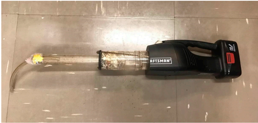
Figure S4. Hand insect vacuum (BioQuip) fitted with a short length of surgical tubing for collection of individual bees.