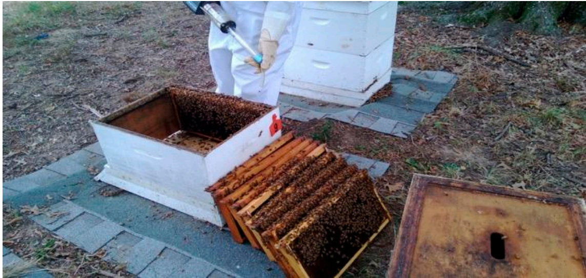
Figure S3. Frames removed as they are checked for painted bees to collect. After the inside of the box is scanned, frames will be returned one by one, slowly checking each side.