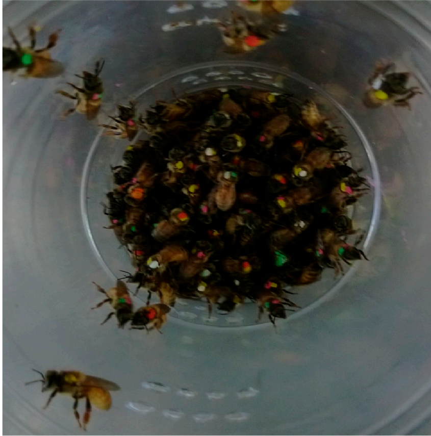
Figure S2. Painted bees returned to a common cup prior to release.