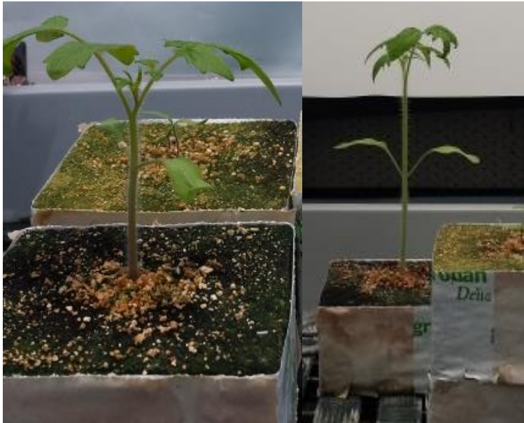
Supplementary Fig. 1: SUN grown plant (left) and SHADE grown plant (right) at about 20 days after sowing, showing the difference in etiolation caused by the light treatments.