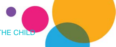
Figure 1.2 provides a schematic summary of the study’s overall view of the complex multi-directional and recursive relationships between the child on the one hand and, on the other, the environments and actors within which and with whom he/she operates, relates and interacts.