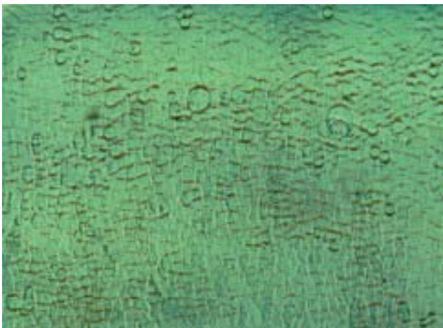
Supplementary Fig. 1. LLC-MK2 cells infected with HCoV-NL63. (a) The CPE of HCoV-NL63 in LLC-MK2 cells. (b) Non-infected LLC-MK2 cells.