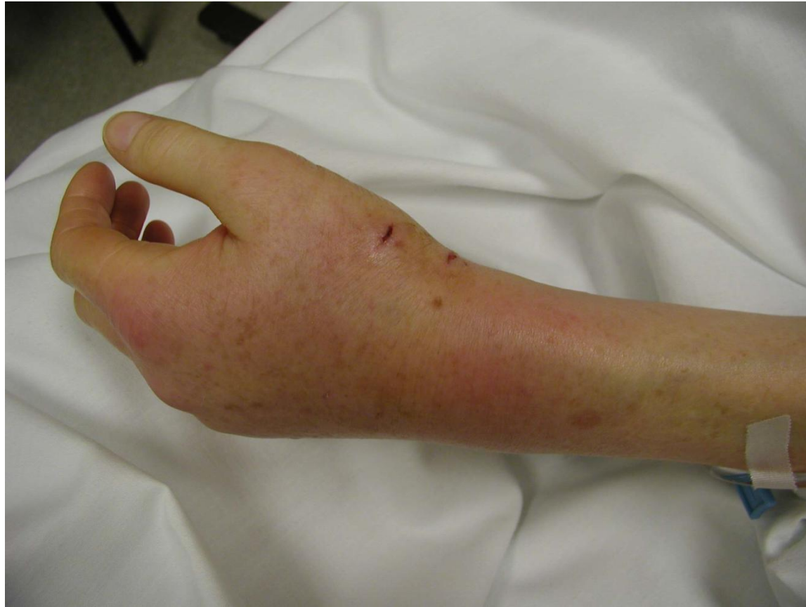
Appendix Figure 4 – Image of a cat bite to the hand.