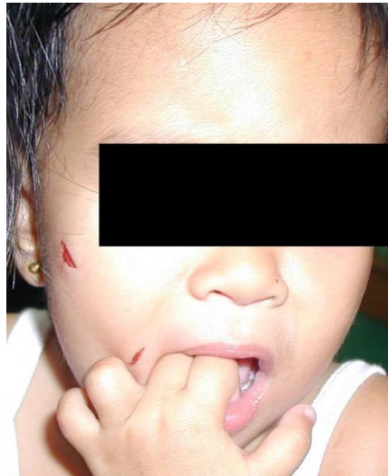
Appendix Figure 3 – Images of a WHO category III exposure dog bite to the face.